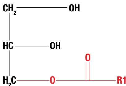
Figure 1. Monoglyceride Chemical Representation in MaxSimil Fish Oils (R1 = fatty acid)

Unique structure: One fatty acid attached to a glycerol backbone provides two polar ends that attract water and a non-polar tail end (R1) that attracts fat, thus enabling self-emulsification of the OMEGA PURE+ formulas.